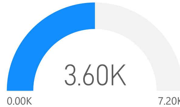
Lost Wages and Productivity