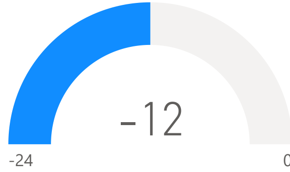
Change in Employment