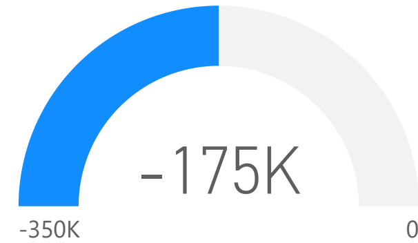
Other Financial Impacts