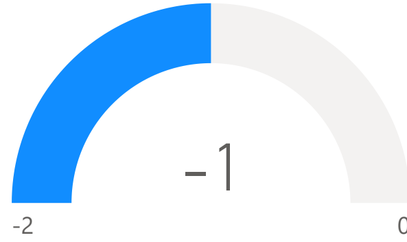
Change in Employment