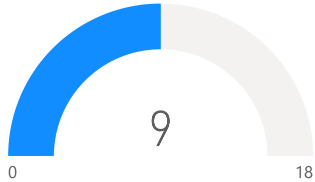
Change in Employment