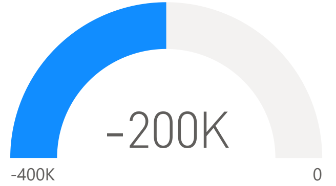
Other financial impact