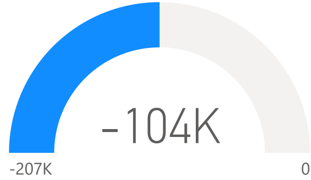
Change in Wages and Productivity