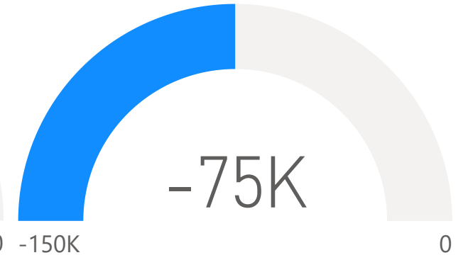
Other Financial Impacts