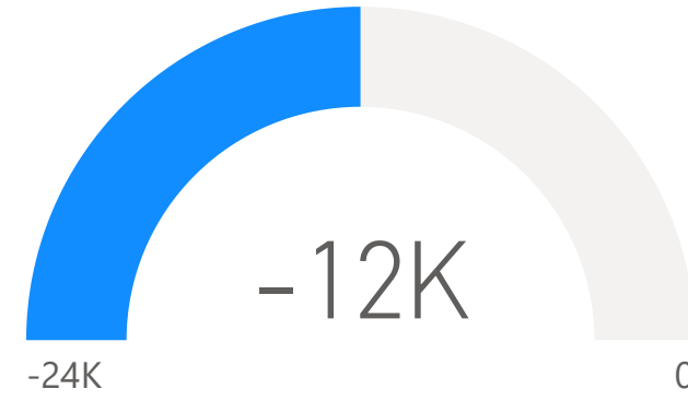
Wage and Productivity Change