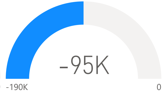
Other Financial Impacts