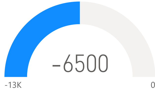
Wage and Productivity Change