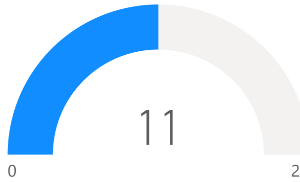
Number of Responses