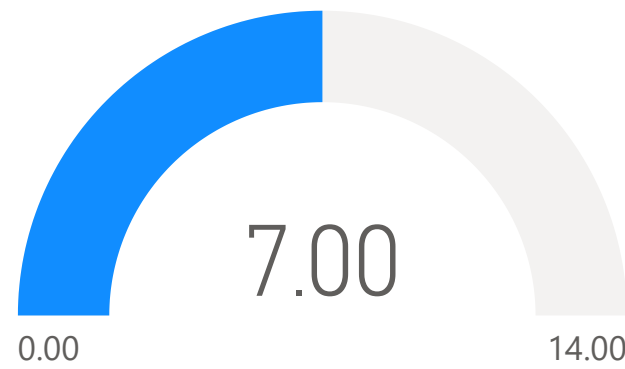
Change in FTE