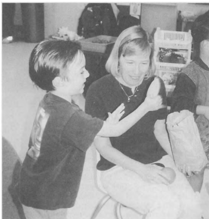
After listening to The Hungry Thing , preschoolers use plastic foods and paper bags located at a literacy center to create their own lunches. Spontaneous retellings and language play often occur at this time.