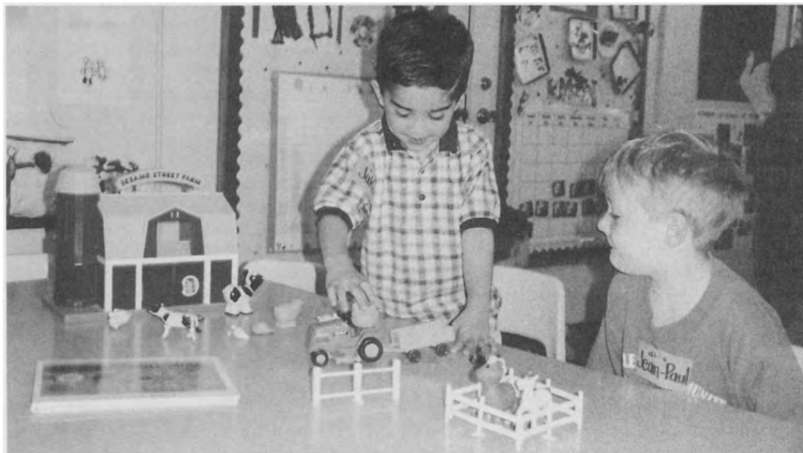
A set of farm animals placed at a literacy center with the recently shared book Cock-a-doodle moo! stimulates further play with sounds and reenactment of the story.