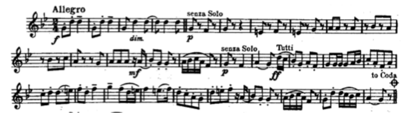
EXCERPT 2: Required Grainger: Colonial Song