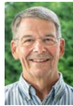
Membership / Promotion