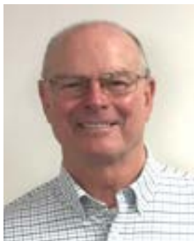
Administrative / Finance