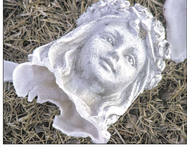
Vandals struck Calvary Cemetery on Algoma Boulevard two times in the past two weeks, where they caused thousands of dollars in damage by smashing statues and knocking over grave markers. SUBMITTED PHOTO